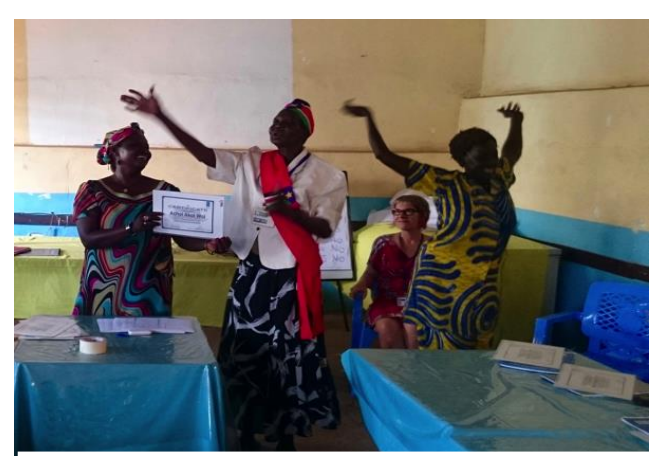
Female participants celebrate receiving their certificates following the completion of the training for traditional leaders, 9-13 May, Aweil.

One hundred thirty-three traditional leaders (33 female) from Yambio, Torit, Kapoeta, Wau and Aweil were trained on women's rights, gender justice and the bill of rights. The training is part of UNDP's efforts to support capacity building of customary law officials for effective administration of justice in accordance with relevant laws of South Sudan, international human rights standards and legal principles. Following the training, traditional leaders from Torit recommended to the Council of Traditional Authority Leaders (COTAL) that 25 percent of customary leaders should be women. COTAL