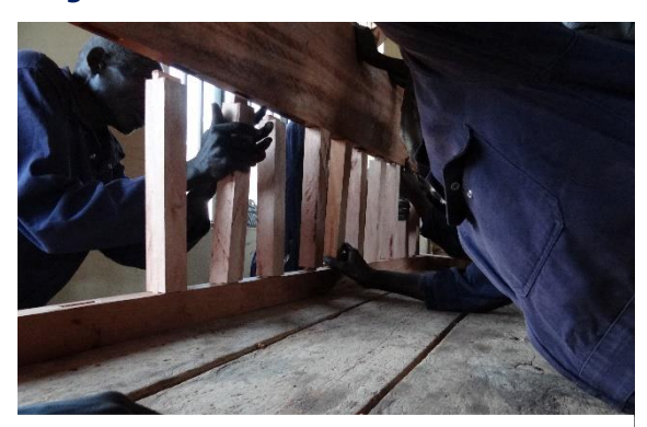
Prisoners develop their carpentry skills at the Vocational Training Center in Juba Central Prison.

UNDP, in coordination with Ministries of Education and Labour and Human Resource Development, worked closely with NPSSS to operationalize the vocational training workshop at Juba Central