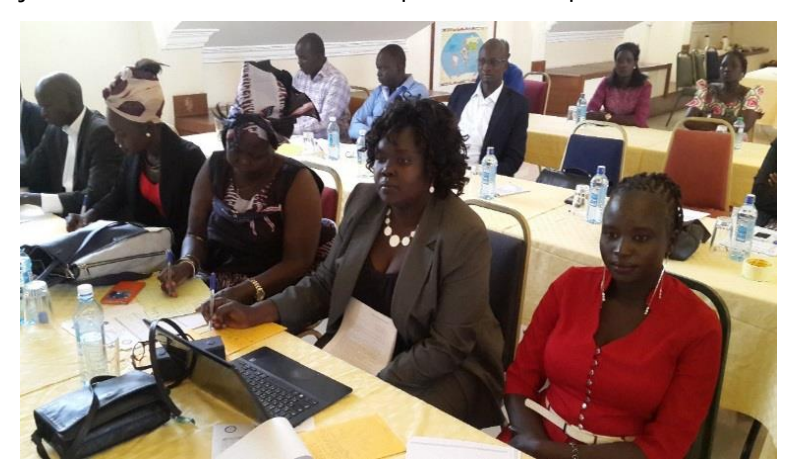
South Sudanese Diaspora discuss transitional justice in Nairobi workshop on 4 February 2016

Building on the global attention generated by the 2015 <u>Perception Survey on Truth, Justice, Reconciliation and Healing</u> and three-day international conference conducted in Juba in November 2015, UNDP supported a one-day workshop in Nairobi attended by 35 participants (nine female) from the South Sudanese diaspora. Participants recognized the importance of combating impunity and addressing the legacy of violence, but expressed concern about the feasibility of transitional justice as provided for in the peace agreement. The outcomes of the international conference on transitional justice in South Sudan were captured in a report which has been used for lobbying purposes. The