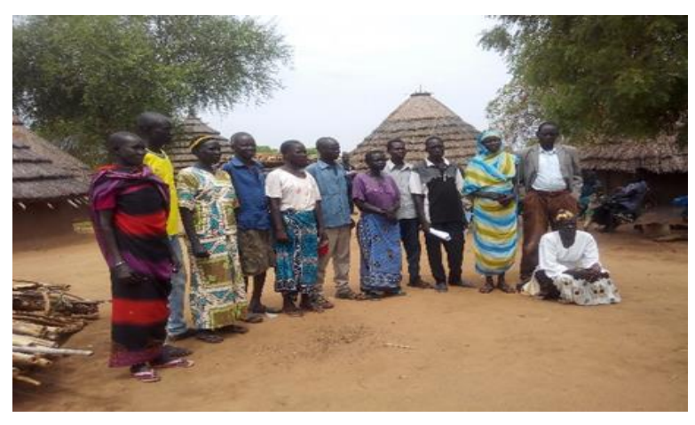
PCRC Meeting held in Illuhum, Torit - Selected PCRC Members (March – 2016)