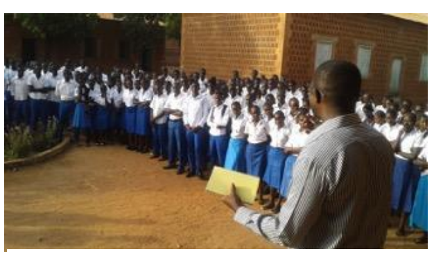
Participants listen to a presentation during a rule of law outreach event at John Paul Secondary School, 4 April,

Thirty-five outreach activities were conducted at state level: 16 rule of law outreach activities and 18 community policing outreach activities, including in schools for 3,854 (1,627 female) community members. UNDP is supporting these outreach activities through co-located Law Enforcement Advisors and Rule of Law Officers by assisting government partners in organizing and providing information at each event. The main topics discussed were SGBV, protection from early marriage, women and